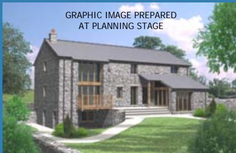
GRAPHIC IMAGE PREPARED AT PLANNING STAGE